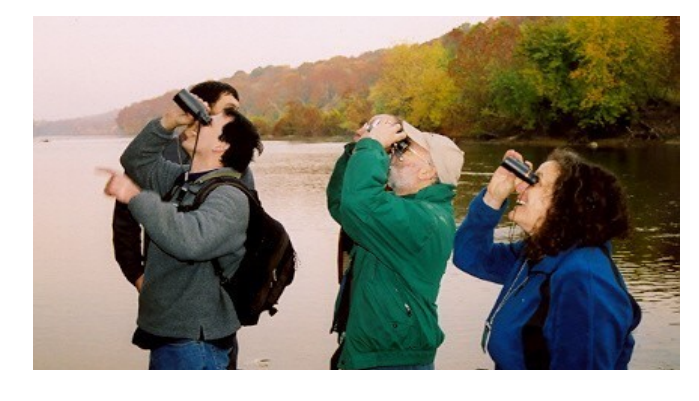
Participants can take advantage of early morning bird watching on the conference center grounds.